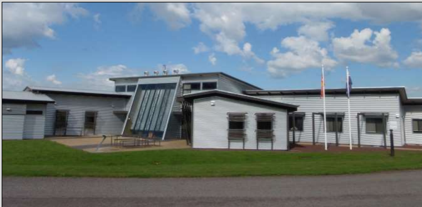
The Gnurad-Gundidj Campus of SSL, near Glenormiston in western Victoria, where six of our Year 9 students will reside for nine weeks in Term 4