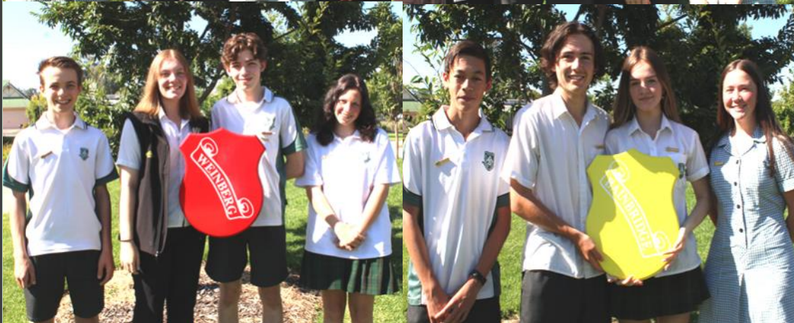
Top - Our current cohort of Year 12's