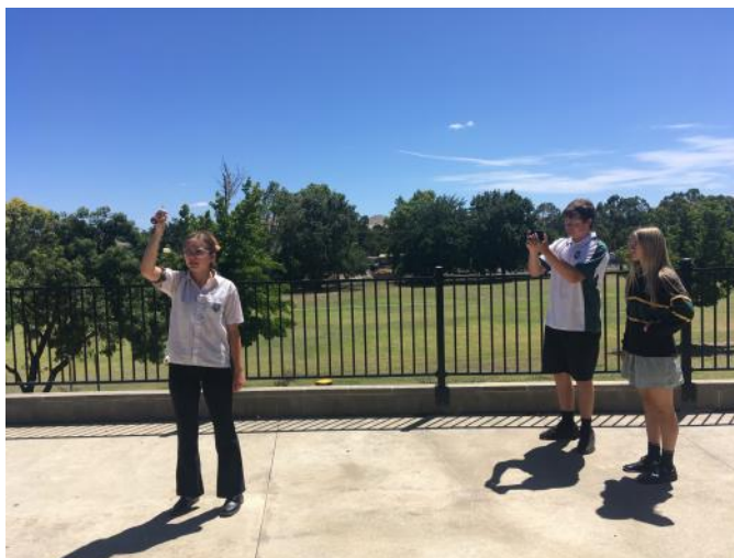
Year 12 Physics Class

Please send resumes to: office@eildonboatclub.com.au or call: 57742040