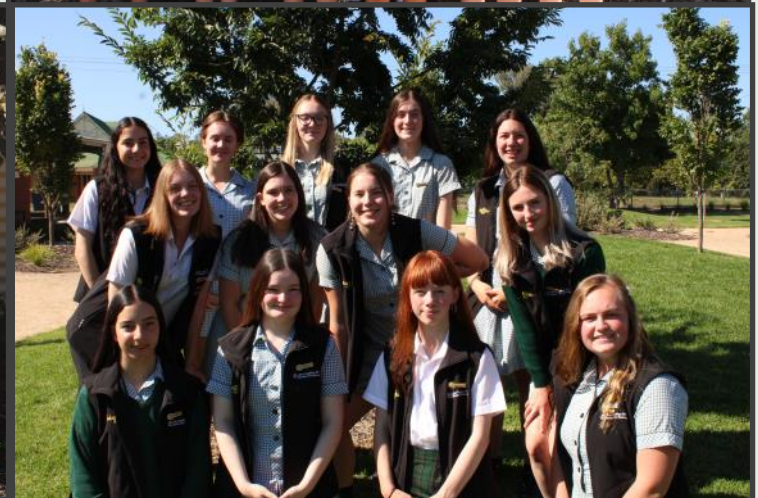
Top Left 2021 School Captains, Top Right, Peer Support Leaders