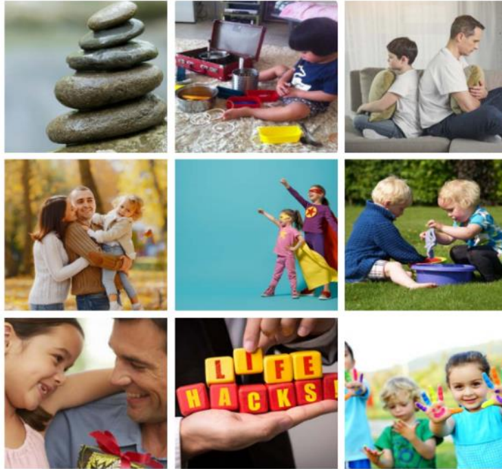
CHILD & FAMILY SERVICES PROGRAM TIMETABLE TERM 1, 2021 Call 5823 7000 for more information