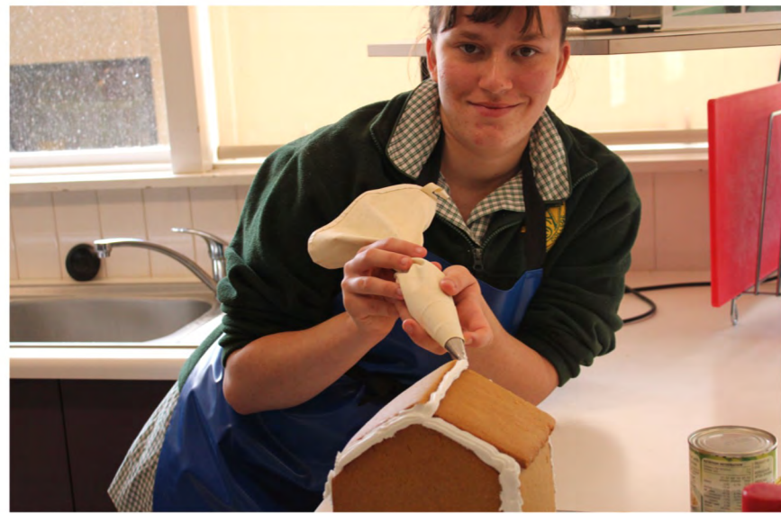
World in Your Kitchen Gingerbread decorating.