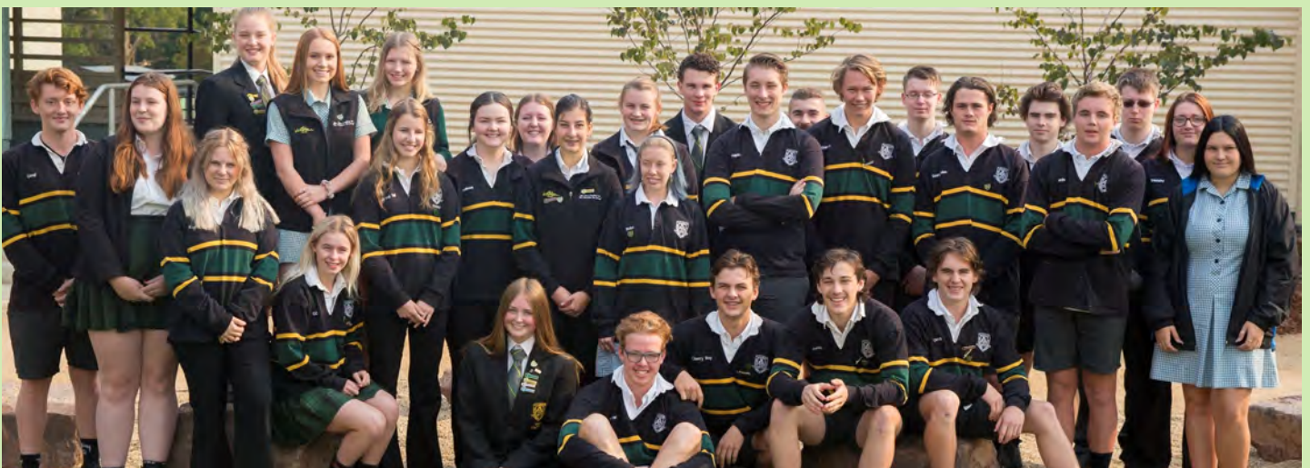
Year 12 Students